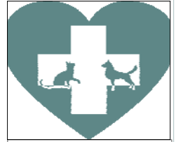
Animal Emergency Services

Help keep Equine Evac going! Members and volunteers greatly needed to keep EVAC going. For information, contact Equine EVAC at 892-4484. In emergency, Call 9-1-1 to activate for personal assistance. Equine Evac is activated through Santa Barbara County Animal Services during a disaster and works closely with Animal Services to evacuate and provide care for evacuated livestock.